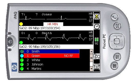
Figure 3: Layout in Landscape mode.

In Landscape mode, with horizontal orientation, the length of ECG traces is increased to 4,24 seconds (4,66 hiding the descriptive icons), but it's possible to display alarms states of only 5 patients at the same time.