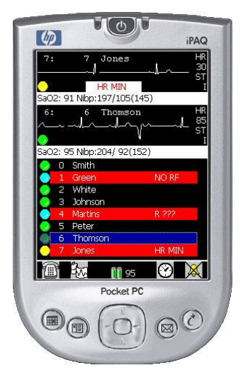
Figura 2: Layout in Portrait mode.

with alarms states of 8 (10 hiding the descriptive icons) patients at the same time.