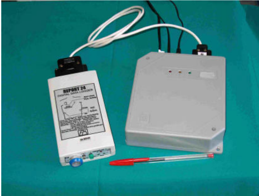
Fig.3. The NICRAM recorder Report-24 (left side) connected to the Smart Modem (right side) through the connection cable