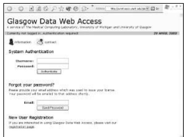
Figure 4. System login, user-level security

Due to the sensitive nature of the data, sufficient security must be maintained on all access to the database. To this effect, user-level access is controlled through a login system; when an individual or an organization is granted access to the database, they are assigned a unique “username” and “password” which is required to access the system. Figure 4 shows the initial screen challenging the user for authentication.