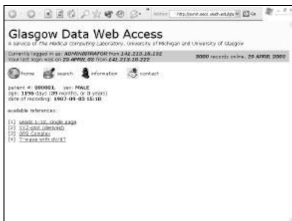
Figure 2. Individual patient record view

Figure 2 demonstrates how an individual patient’s record would appear using the scheme described above. In this case, we have four categories: individual lead plots, XYZ-plots, QRS complex, and T-wave with dV/dT plots. These categories appear as links from the patient record page that serves to retrieve the image itself.