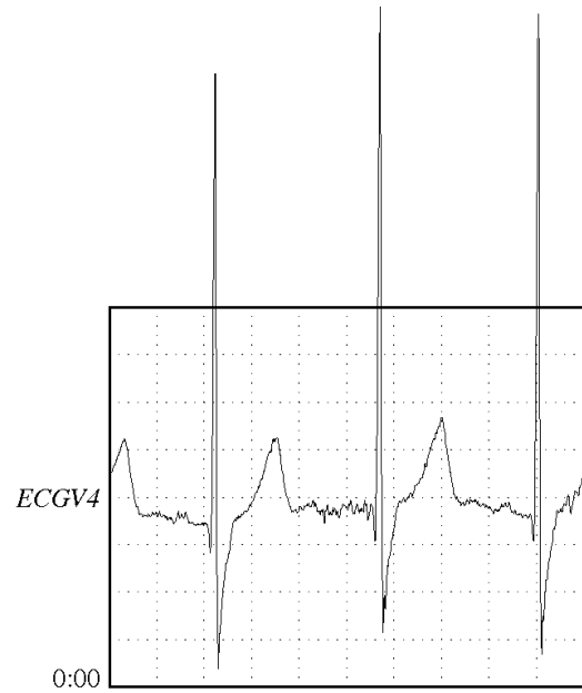
Figure 2. Pediatric ECG with QRS slopes > 1.0 mV/ms, Grid: 0.2 sec, 0.5 mV

The quality level is calculated for each lead every 2 seconds. The algorithm looks for the lead with the smallest quality level. If the quality level of this lead is less than the quality level of the currently selected, the algorithm switches to this lead. A hysteresis level is used in the quality level comparison to avoid oscillations between two leads with very similar quality levels.