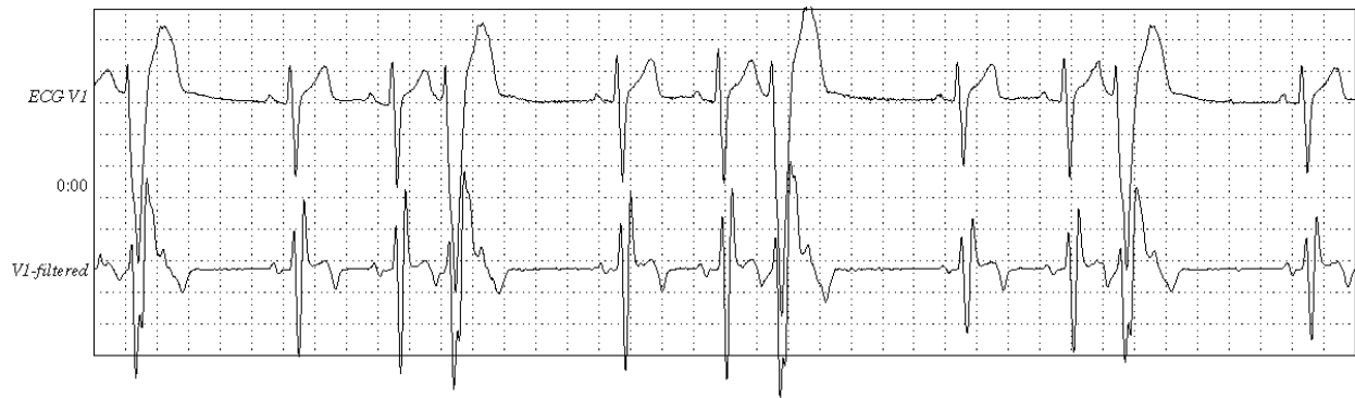
Figure 4. Original ECG (first row) and filtered ECG (second row). The difference in the amplitude between normal QRS complexes and ventricular premature beats is smaller in the filtered ECG than in the original ECG. Calculating the QRS amplitude from the filtered ECG prevents undesired lead switching due to large VPB amplitudes.