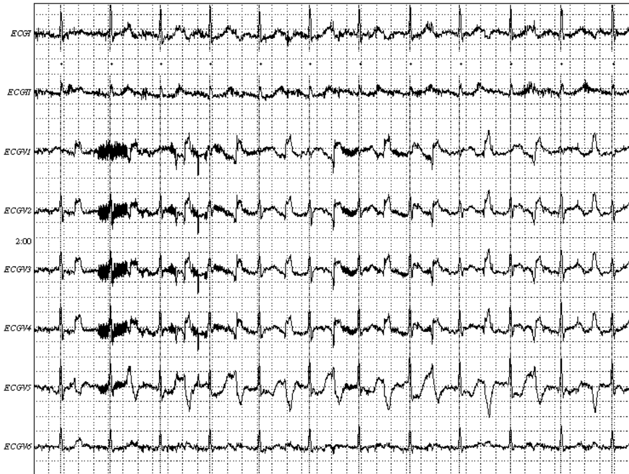
Figure 5. Stress test ECG with cyclic artifacts produced by footfall on a treadmill. Leads V1 to V5 are distorted. Only in leads I and V6 the QRS complexes can be detected properly.