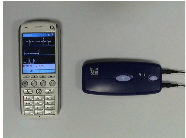
Figure 2. O 2 smart phone and Alive Technologies ECG sensor

The algorithm has been implemented on O 2 XPhone IIm running Windows Mobile 2003 Smart Phone Edition. This smart phone uses ARM OMAP 730 processor running at 200MHz. Besides it has a Bluetooth connectivity to connect wirelessly with Alive Technologies ECG sensor which is used to capture the ECG data. Figure 2 depicts the O 2 smart phone and the Alive Technologies ECG sensor.