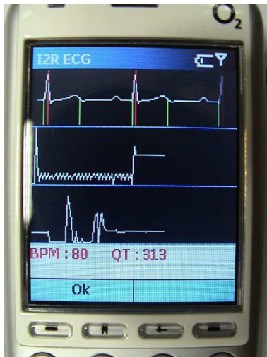
Figure 3. Data display on smart phone. Top row: ECG signal with annotated QRS peak (red line), Q-wave onset (green line) and T-wave offset (green line). Middle row: Heart rate variation. Bottom row: Movement intensity as derive from accelerometer embedded in ECG sensor. BPM and QT denote heart rate (in beats per minute) and QT interval (in milliseconds) respectively.

In this implementation, each computational cycle required approximately 12 multiplications, 6 divisions, 101 additions and 34 subtraction operations. With 300Hz data rate, the smart phone is capable of processing the data in real-time.