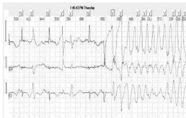
Figure 1: Example of ECG tracings of the onset of a drug-induced TdPs in one of the dLQTS patients.

1: repolarization instability; 2: action potential triangularization; 3: repolarization delay; 4: increased heterogeneity of repolarization (apico-basal, inter-ventricular, transmural); 5: early after depolarization); \Delta T amp: changes in amplitude of T-wave.