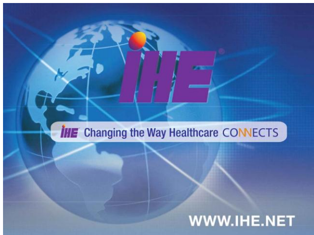
Figure 1. Logo from IHE organization

In various domains, IHE integration profiles specify how for that specific domain and topic data can be exchanged based on existing standards. Therefore, IHE is not a standard; it merely specifies which standards should be used in a certain domain, and how they should be used. Systems that support IHE Integration Profiles work together better, are easier to implement, and help care providers use information more effectively [5].