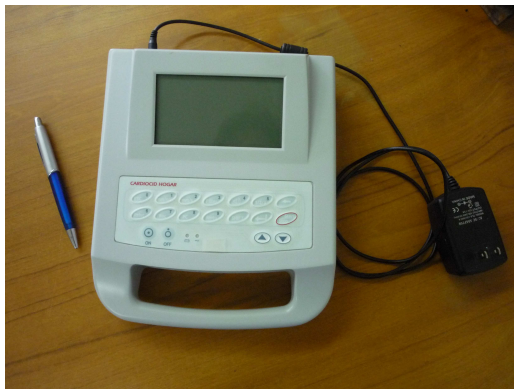
Figure 1. View of CardiHogar recorder.

The multichannel ECG amplifier is dedicated to acquire and adequate the electrocardiographic signals generated by the patient. These analogue signals are converted to digital values at a sampling rate of 500 Hz [2].