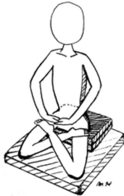
Figure 1. Body posture of Zazen. Left: Statue of Buddha, Right: Schematic representation of lotus position. See text.