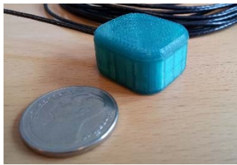
Figure 1. The CLW accelerometer.

a 3-axis accelerometer. The CLW accelerometers were calibrated using a B&K vibration exciter and reference accelerometer (Brüel & Kjær, Nærum, Denmark).